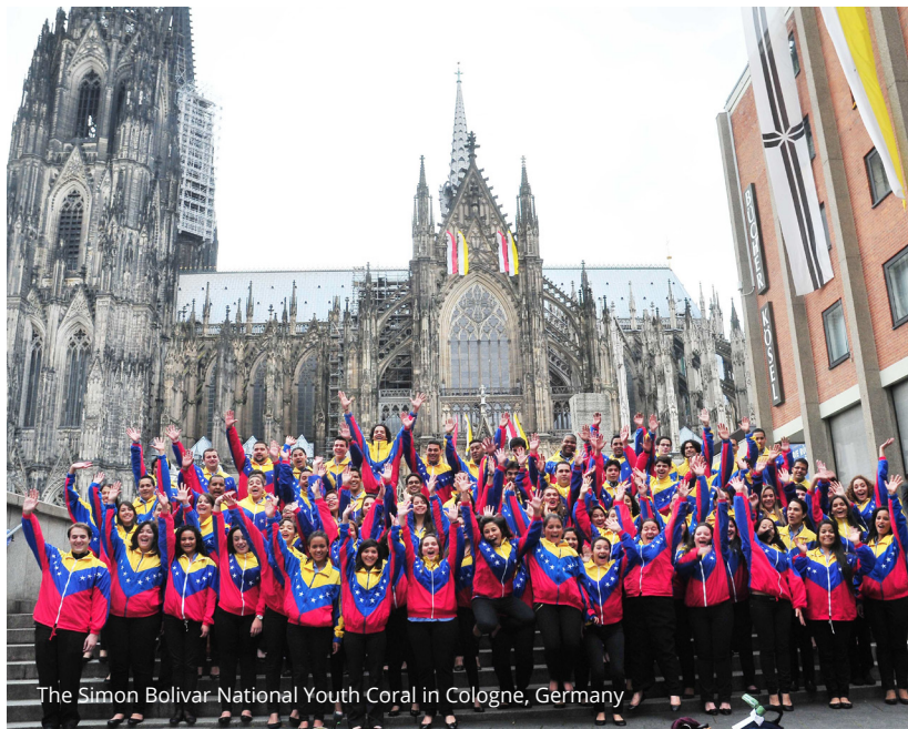
The Simon Bolivar National Youth Coral in Cologne, Germany

repertoire; and they succeed on national and international stages. The enormous scale and growth achieved by the Orchestra and Choir Program requires organizational structure and effective national management. This national efficiency has enabled the formation of a wide range of local branches. They are located in all regions and cities of Venezuela, and they contain seven regional-branches of the Simon Bolivar Music Conservatory. Each branch has enough space for 18 academies, specializing in the study of an equal number of instruments, and serves as the headquarters for all the orchestras, groups, choirs and programs of El Sistema. The modular structure allows El Sistema to reach the most remote towns in the country, in border area communities, in neighborhoods, and schools, so that no Venezuelan child is left outside the joy and growth brought by music.