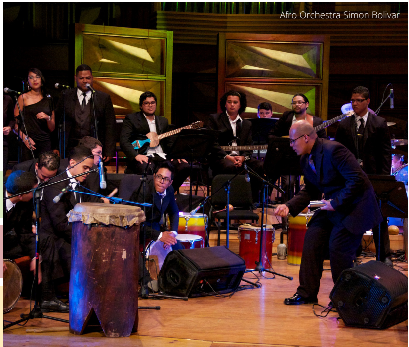
Afro Orchestra Simon Bolivar

3919 students are members of the Simon Bolivar Music Conservatory