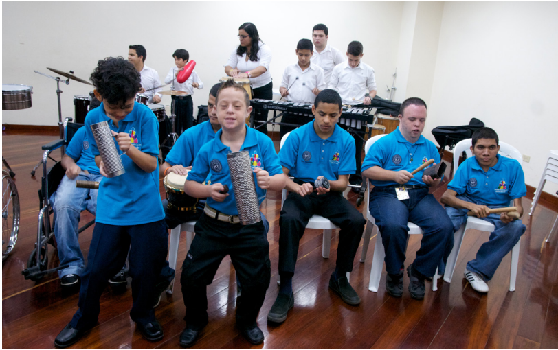
Member of the PEE in Zulia and Anzoátegui

“ I am a blind violinist. I have been able to read music thanks to the Braille system. I am a happy person because of El Sistema’s orchestras and choirs, and the light music has given to me ”