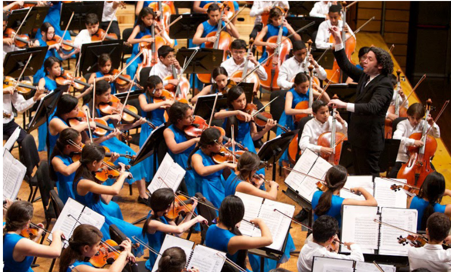
Gustavo Dudamel in concert with the National Children's Symphonic Orchestra of Venezuela

In front of the music stand and under the leadership of the conductor, music becomes powerful agent for positive change. Students learn to work in teams, striving to achieve ambitious objectives; they progress through the challenges of escalating levels in the program; they master a sequential symphonic and choral