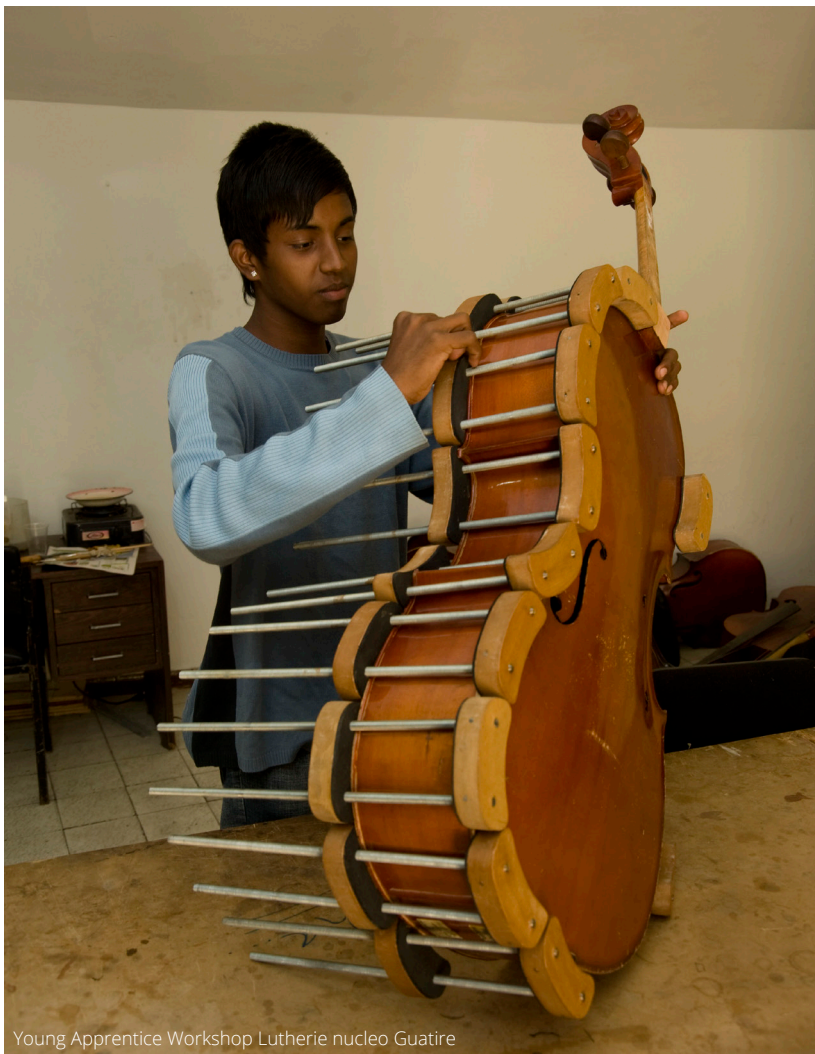
Young Apprentice Workshop Lutherie nucleo Guatire

“ One of my dreams is that we can cater the national market demand with our hand-made musical instruments, in which we poured our hearts. For us, the most significant aspect is that every violin, every viola, every harp, or every cuatro made in CAL, is played by a student of El Sistema, and that they feel proud to have it ”