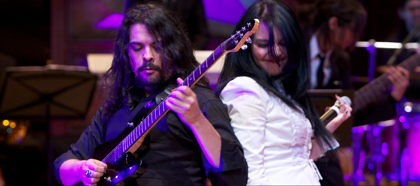
The rock and jazz, two attractive genre for students of El Sistema